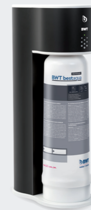
BWT bestaqua ROC

As Europe's leading water optimizer, we offer all the technologies needed to prepare the best water for every need. Whether it's basic limescale protection, cation exchange/water softening or de-mineralization/reverse osmosis, whether simple filter cartridges or an innovative system, whether for a little water or a lot of water at one location – our product range and know-how will enable you to install the very best solution.