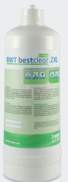
BWT bestclear EXTRA